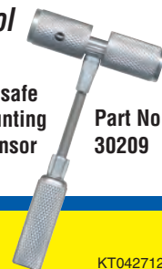
Part No. 30209

TPMS Sentry™ Sensor Service Tool Designed to keep the sensor in a safe and secure position after the mounting nut has been removed and the sensor is released from the wheel.