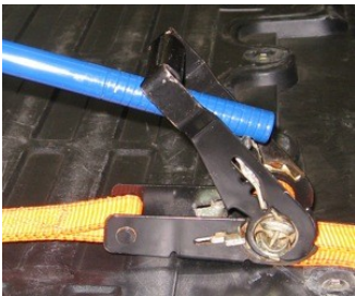
QUICK CHEATER BAR