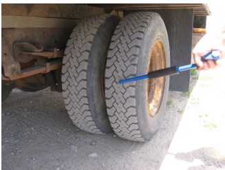
QUICK TIRE CHECK