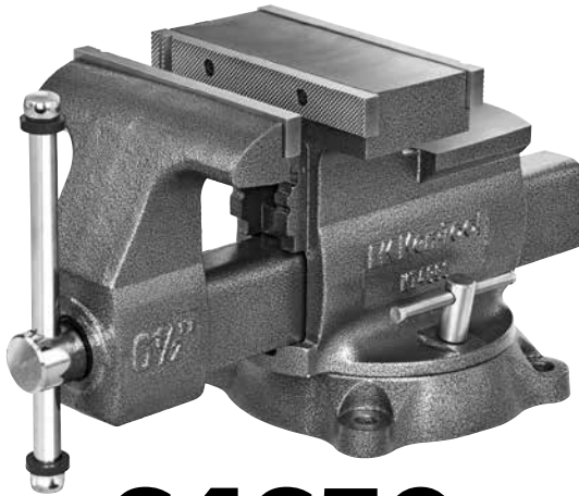
64650 6.5" Reversible Vise