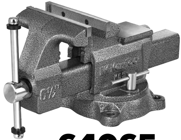
64065 6.5" Vise