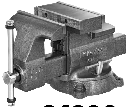
64800 8" Reversible Vise