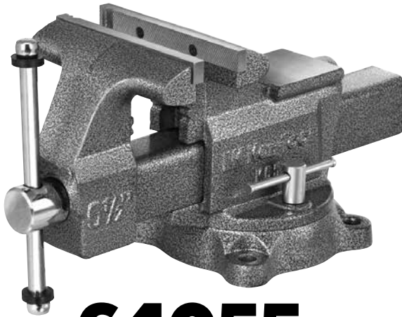
64055 5.5" Vise