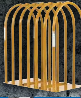
7-BAR CAGE PN 36008