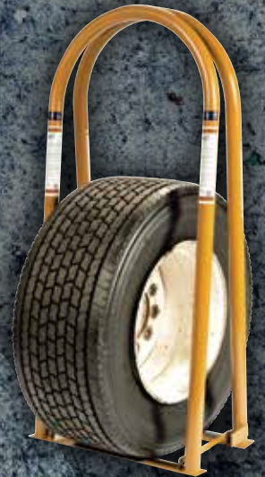
T109 MAGNUM™ 5-BAR CAGE PN 36009