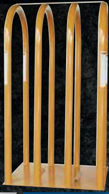
4-BAR CAGE PN 36002

A must for run-flat, low-profile, and other tires that are difficult to seat.