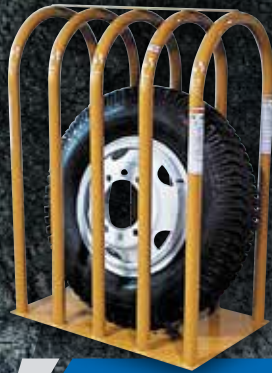
5-BAR CAGE PN 36005