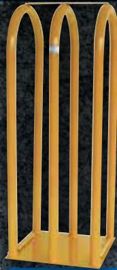
3-BAR CAGE PN 36006