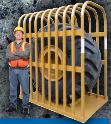
T112 12-BAR CAGE PN 36012

10-bar construction fits up to 29.5R25 L-3 Earthmover.